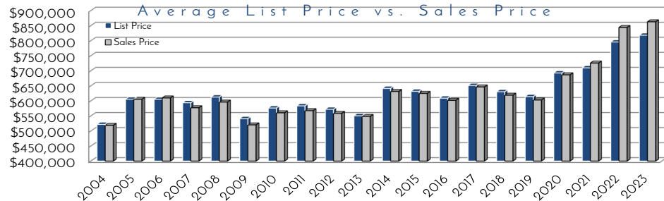
Average List Price vs. Sales Price